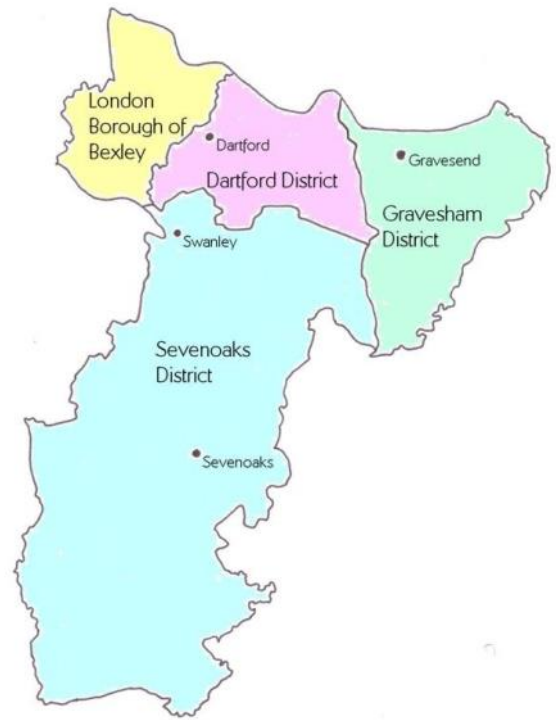
NWKCP area of operation in Kent

We receive a core amount of our funding from Kent County Council, London Borough of Bexley and Sevenoaks District Council. The rest of our funding is brought in through individual project funding and occasional donations.