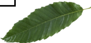
Sweet Chestnut– 15 Points