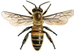
Honeybee– 5 Points