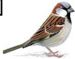
House Sparrow– 10 Points