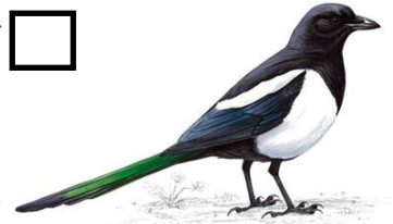
Magpie– 10 Points