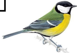
Great Tit– 10 Points