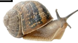
Snail– 3 Points