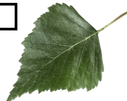
Silver Birch– 15 Points