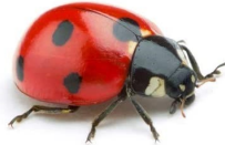
Ladybird– 4 Points