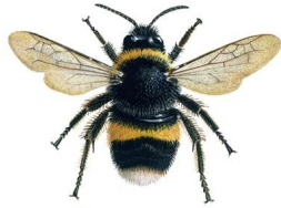
Bumblebee– 5 Points