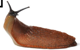
Slug– 3 Points