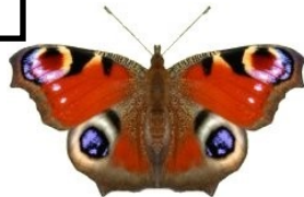
Butterfly– 8 Points