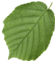
Hazel– 15 Points