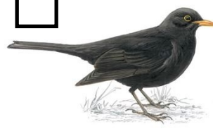
Blackbird– 10 Points