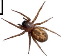
Spider– 4 Points