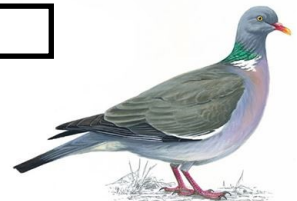
Pigeon– 10 Points