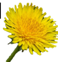
Dandelion– 5 Points