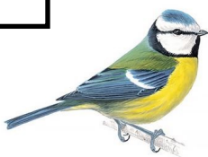
Blue Tit– 10 Points