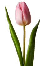
Tulip– 5 Points