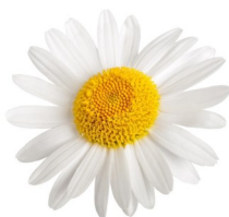
Daisy– 5 Points