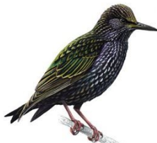
Starling– 10 Points