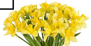
Daffodils– 5 Points