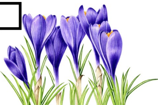
Crocus– 5 Points