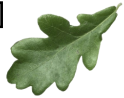
Oak Tree– 15 Points