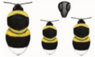
Q W M Garden bumblebee Bombus hortorum