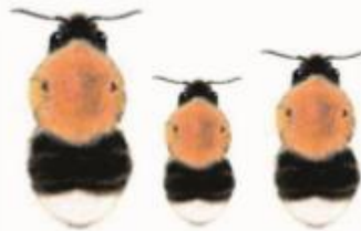
Q W M Tree bumblebee Bombus hypnorum