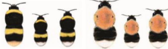
Q W M Buff-tailed bumblebee Bombus terrestris