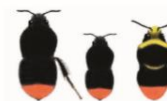
Q W M Red-tailed bumblebee Bombus lapidarius