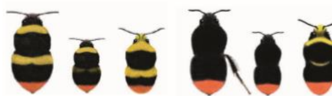
Q W M Early bumblebee Bombus pratorum