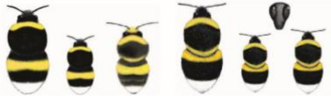
Q W M White-tailed bumblebee Bombus lucorum